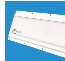
Industry-leading LED lighting with 5-year warranty