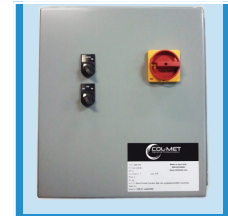
Optional UL & ETL listed control panel