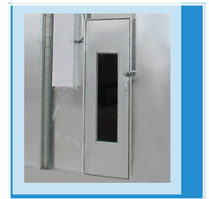
Windowed personnel access doors