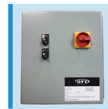
Optional UL & ETL listed control panel