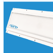
Industry-leading LED lighting with 5-year warranty