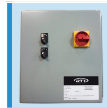
Optional UL & ETL listed control panel