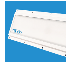
Industry-leading LED lighting with 5-year warranty