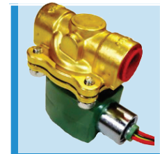
Air solenoid valve