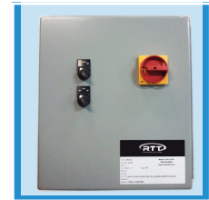
Optional UL & ETL listed control panel