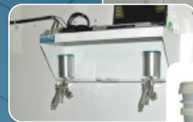
Spray Gun Rack