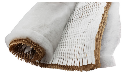
FilterLoc allows RTT manufactured W-Series blanket media to be used reducing exhaust filtration costs.